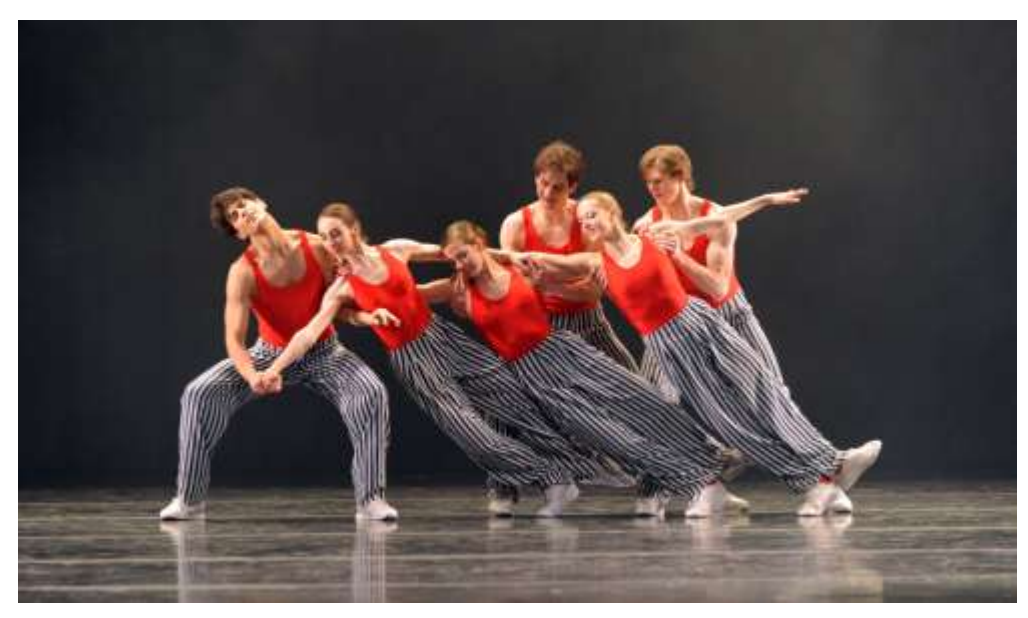
In the Upper Room, by Twyla Tharpe, 2010.

have no storyline: rather they utilize the movement of the body and theatrical elements to interpret music, create an image, or to express or provoke emotion. George Balanchine was a prolific creator of plotless ballets.