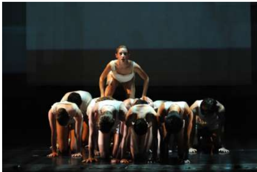
Light: The Holocaust and Humanity Project, by Stephen Mills, 2009

Ballet is an art form created by the movement of the human body. It is theatrical—performed on a stage to an audience utilizing costumes, scenic design and lighting. It can tell a story or express a thought or emotion. Ballet can be magical, exciting, provoking or disturbing.