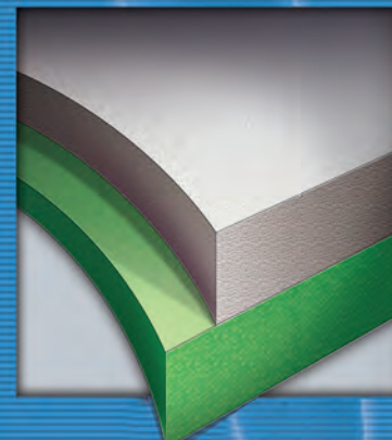
● Homogeneous PVC with non-slip surface ● Homogeneous PVC with non-slip surface