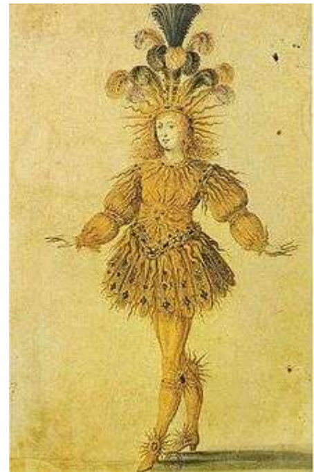
King Louis XIV in Ballet de la nuit , 1653

By 1661 a dance academy had opened in Paris and in 1681 ballet moved from the courts to the stage. The French opera Le Triomphe de l'Amour incorporated ballet elements in its performance, creating a long-standing opera-ballet tradition in France. By the mid-1700s French ballet master Jean Georges Noverre rebelled against the artifice of opera-ballet, believing that ballet could stand on its own as an art form. His notions—that ballet should contain expressive, dramatic movement, and that movement should reveal the relationships between characters—introduced the ballet d'action , a dramatic style of ballet that conveys a narrative. Noverre's work is considered the precursor to the narrative ballets of the 19th century.