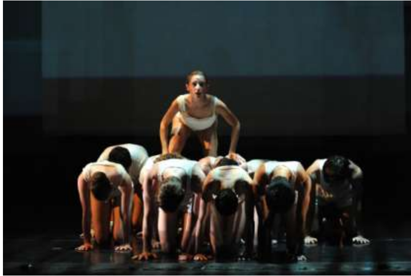
Light: The Holocaust and Humanity Project , by Stephen Mills, 2009

Ballet is an art form created by the movement of the human body. It is theatrical—performed on a stage to an audience utilizing costumes, scenic design and lighting. It can tell a story or express a thought or emotion. Ballet can be magical, exciting, provoking or disturbing.