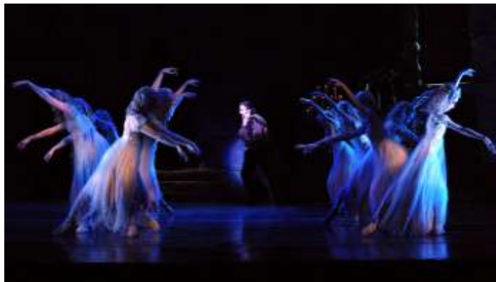
2011 production of Dracula.