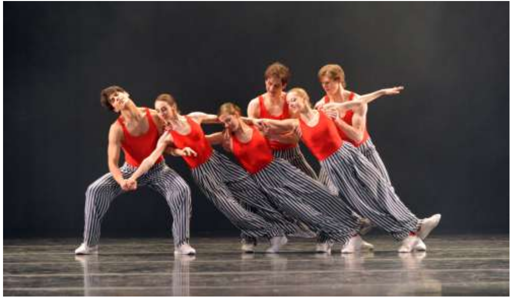
In the Upper Room , by Twyla Tharpe, 2010.

Plotless ballets have no storyline: rather they utilize the movement of the body and theatrical elements to interpret music, create an image, or to express or provoke emotion. George Balanchine was a prolific creator of plotless ballets.