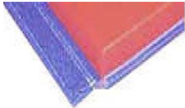
Mat corner showing Velcro® on edges