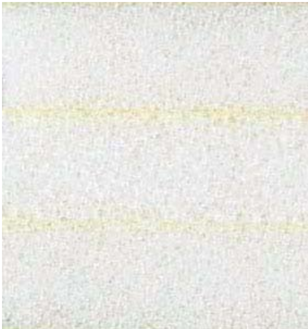
Cross-link polyethylene closed cell foam.

White, Yellow, Beige, Grey, Light Blue, Orange, Dark Green, Red, Royal Blue, Maroon, Purple and Black