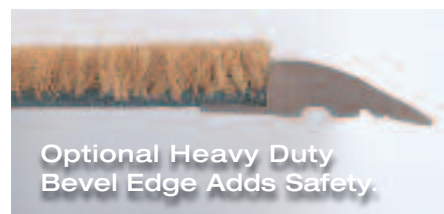
Optional Heavy Duty Bevel Edge Adds Safety.